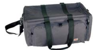
Carrying bag LTR 100