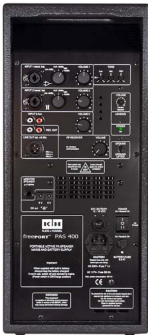
freePORT PAS 400 rear view