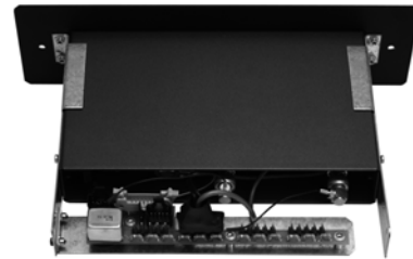
Mounting for Evolution Wireless diversity rack receiver