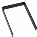
Mounting bracket LH 26