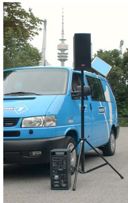
freePORT PAS 400 in use