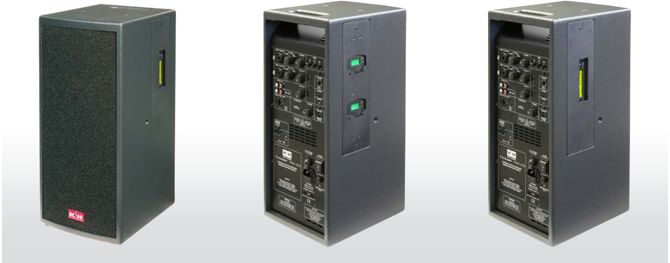
freePORT PAS 400