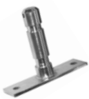
TV-spigot LH 29