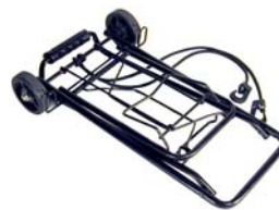
Trolley LRR 100