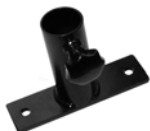
Tripod stand adaptor LH 28