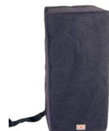
Rain and protective Cover LRH 100