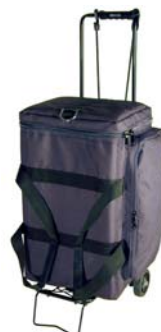
Carrying bag with Trolley